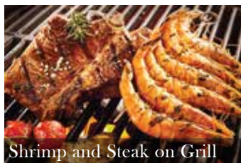
Shrimp and Steak on Grill